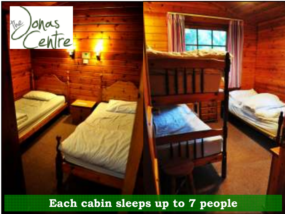
Each cabin sleeps up to 7 people