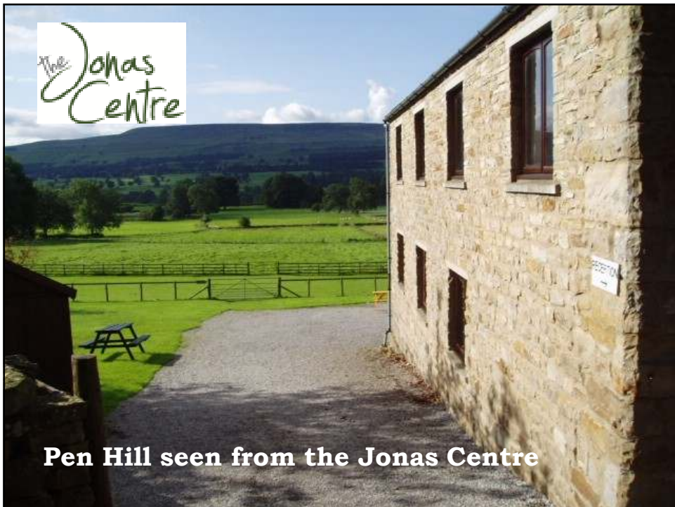
Pen Hill seen from the Jonas Centre